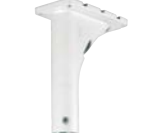
WV-QCL501-W Mount Bracket