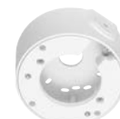
WV-QJB502A-W Mount Bracket