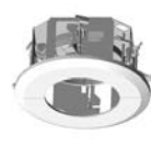
WV-QEM505-W Ceiling Mount Bracket