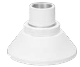
WV-QSR506F-W Mount Bracket