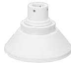
WV-QSR506-W Mount Bracket