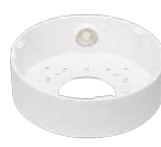
WV-QJB505-W Base Bracket