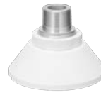
WV-QSR506M-W Mount Bracket