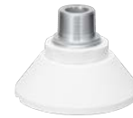
WV-QSR506M1-W Mount Bracket