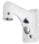
WV-QWL501-W Mount Bracket