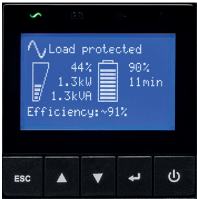
9SX graphical LCD