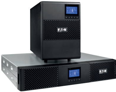
9SX Rack & Tower models