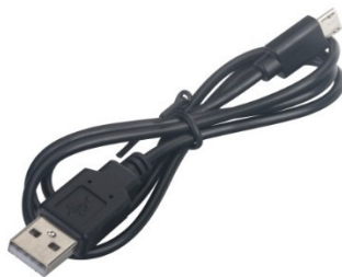
USB Power Cable